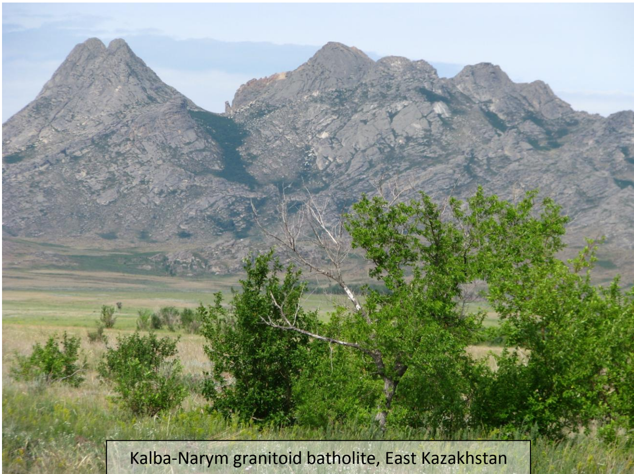
Kalba-Narym granitoid batholite, East Kazakhstan

A.A. Trofimuk Institute of Petroleum Geology and Geophysics SB RAS