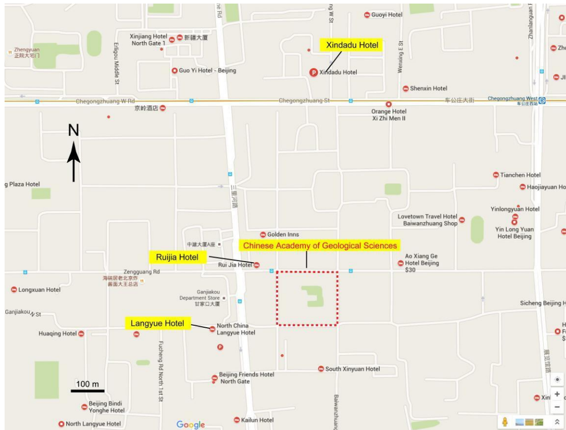
Fig. 2 Locations of the hotels around CAGS.

Standard room in the Adjacent Building ( Two stars ): RMB 280/USD 46 ( NOT including breakfast)